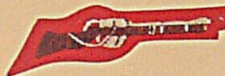
2nd CLASS SHOT FULL BORE RIFLE