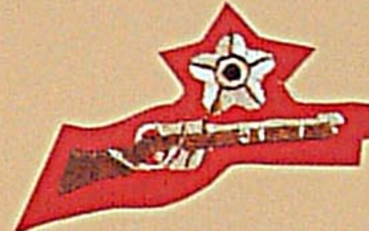
1st CLASS SHOT FULL BORE RIFLE