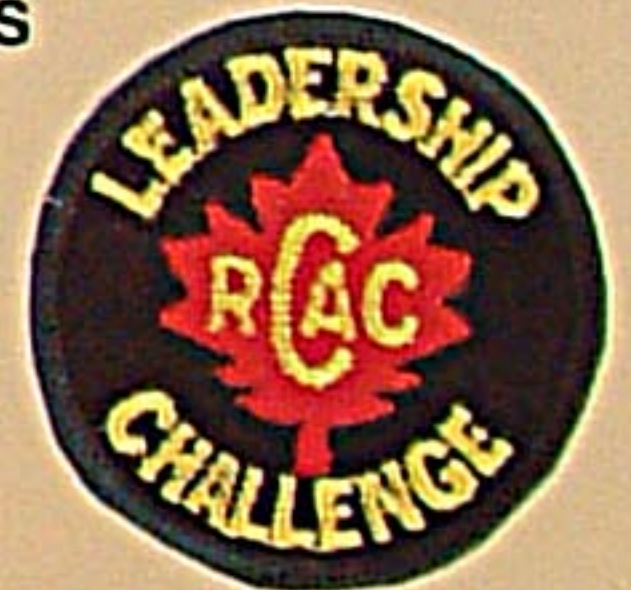
CANADIAN CADET CHALLENGE AND LEADERSHIP