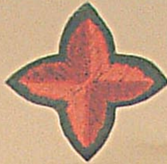
ARMY PROFICIENCY CERTIFICATE