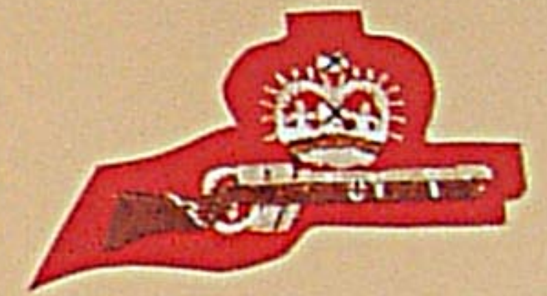
MARKSMAN FULL BORE RIFLE