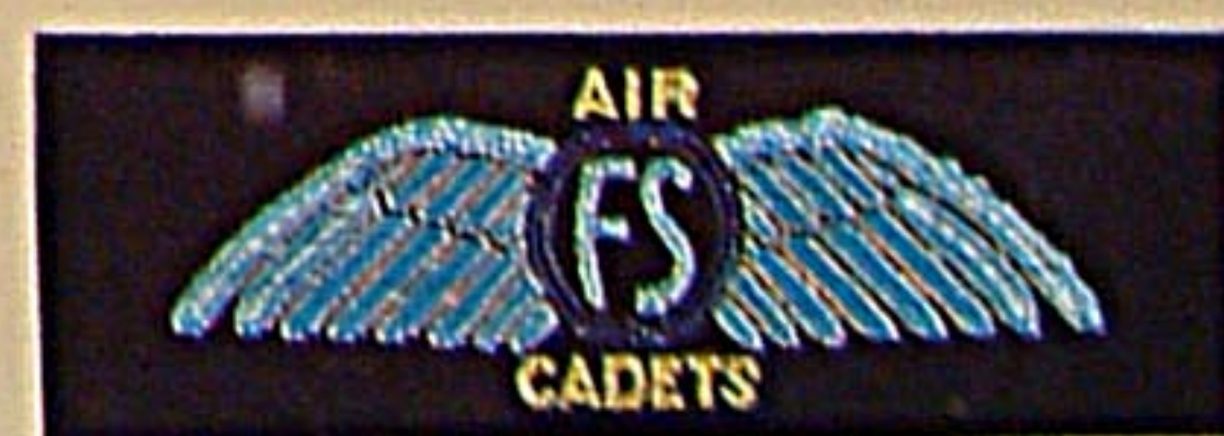
ROYAL AIR FORCE

Proficiency and skill-at-arms badges earned by cadets are to be worn on the armet brassard. Not more than four proficiency and skill-at-arms badges are to be worn at any one time. They are to take precedence from top right to top left to bottom right to bottom left. The eight groups of badges are depicted above in their order of precedence, the APC badges taking highest precedence. Badges are shown in ascending order of precedence from left to right in the following groups: APC, Duke of Edinburgh's Award, Skill-At-Arms (shot classification badges only), and Cadet Leadership Courses. No cadet is to wear more than one of the badges awarded for small bore or full bore shooting. The highest badge held whether small bore or full bore, is to be worn. When a cadet is entitled to badges of equal value for small bore or full bore, the full bore badge is to take precedence. The four permissible badges are to be worn in accordance with these rules of precedence by groups and where applicable by precedence within groups.