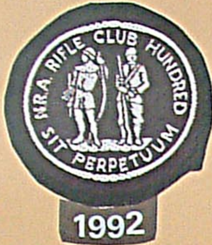
CADET HUNDRED FULL BORE