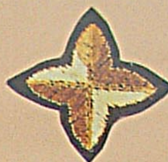
ARMY PROFICIENCY CERTIFICATE (ADVANCED)