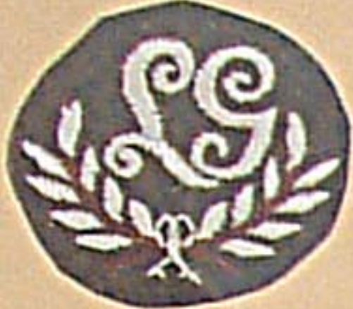
LIGHT MACHINE GUN (BREN) MARKSMAN