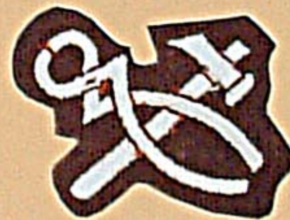
ROYAL ELECTRICAL AND MECHANICAL ENGINEERS