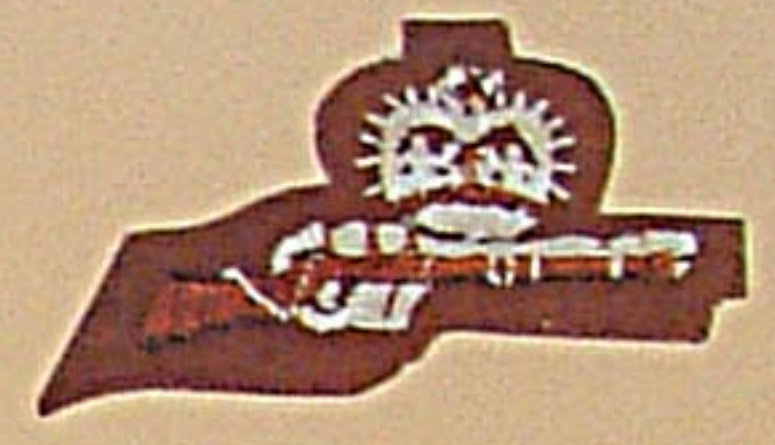
MARKSMAN .22 RIFLE/AIR RIFLE