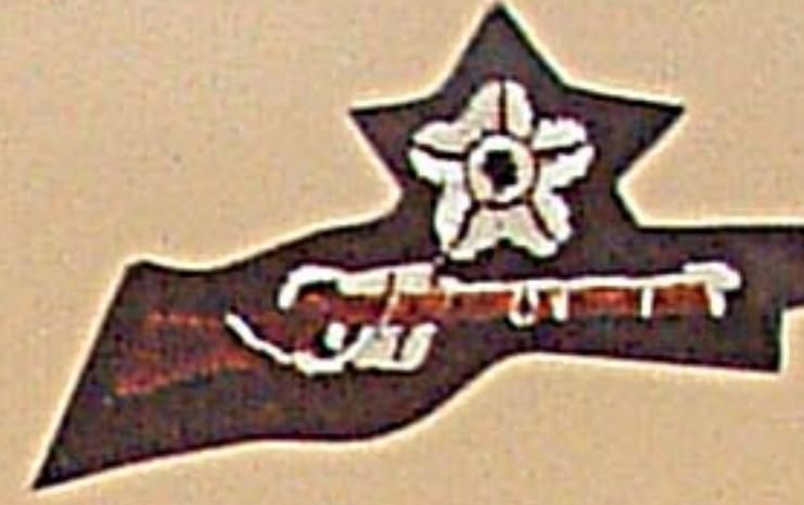
1st CLASS SHOT .22 RIFLE/AIR RIFLE