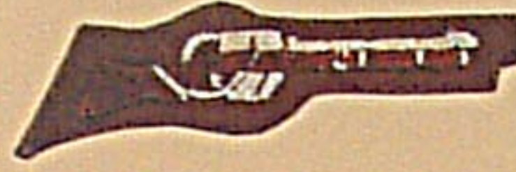
2nd CLASS SHOT .22 RIFLE/AIR RIFLE